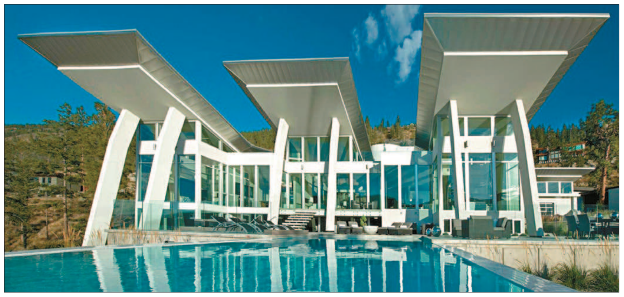
All Elements won a number of Tommies for Sin-Ceras, a waterfront home in Sheerwater.