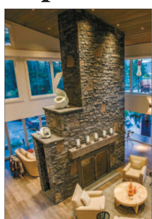
Excellence in single-family detached home garnered Edgecombe one of its many Tommies.

The outdoor space has a beautiful infinity edge pool that is accentuated with two fire bowls. There is a barbecue area with countertops and cabinets, eating area, a lounge area by the fireplace and TV as well as a hot