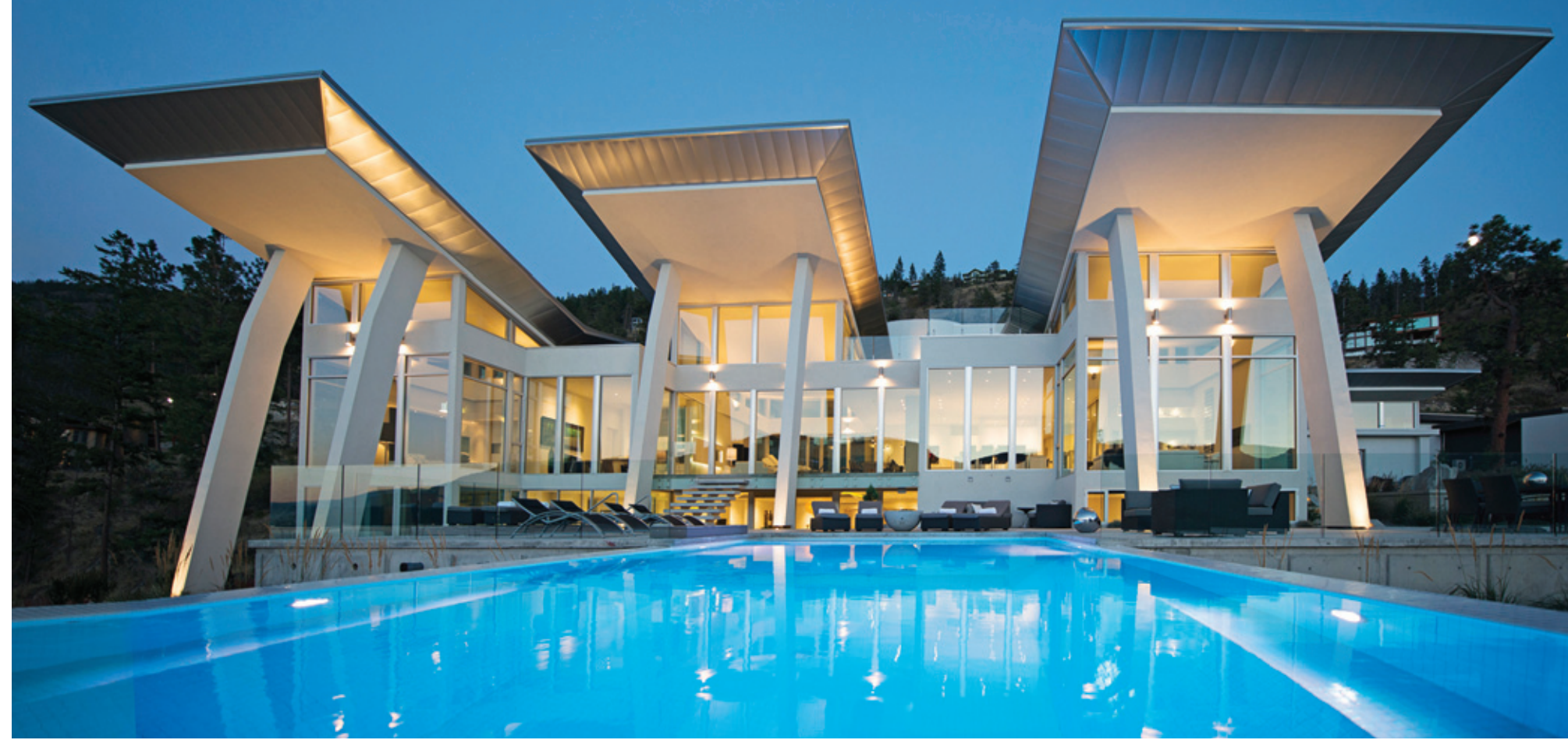
The designer and builder of this Shearwater home — All Elements Design Manage Build — picked up the prestigious Grand Tommie for Home of the Year at the 2014 Tommie Awards on the weekend in Kelowna. The spectacular Sin~Ceras home is a contemporary, three-level home that incorporates many outstanding features both inside and out, including a three-sided infinity pool.